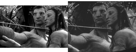
Figure 3: An iconic scene from the movie Avatar, and the converted image projected to a 8 m × 4.5 m virtual canvas in the 8 m diameter digital planetarium of the Eötvös University

We prepare the converted slide with the method of ray-tracing. We place the virtual canvases to the planetarium dome. The canvases can be placed anywhere relative to the dome. The position, size, tilting angle and the number of the canvases can be set manually in the program (Figure 1). The planetarium geometry, such as the dome diameter and the position of the observers relative to the dome center can also be adjusted (Figure 1). The canvases can be placed anywhere compared to the dome. Then we put the input (plain) slide to the virtual canvases. After that we go through the projected pixels and connect the observer position and the projected pixels of the digital planetarium with straight lines. For every line we calculate the intersection with the virtual canvas and look, which pixel we hit on there. Then we adjust the given dome pixel to the same color.